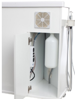
Rear compartment 4" W X 12"D X 20" H