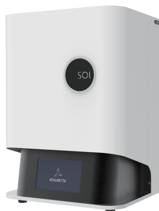
SOL 3D Printer