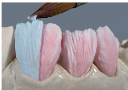
Translucent layer between Body and Opal Incisal