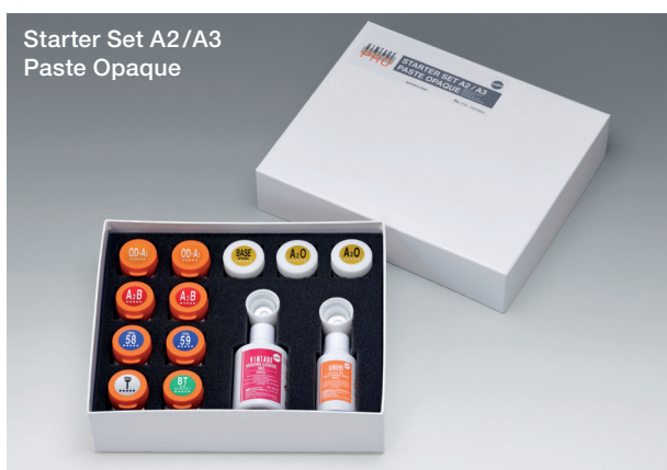
Starter Set A2/A3 Paste Opaque