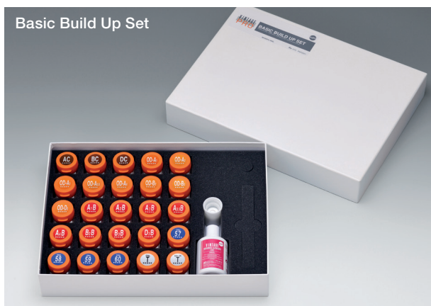
Basic Build Up Set