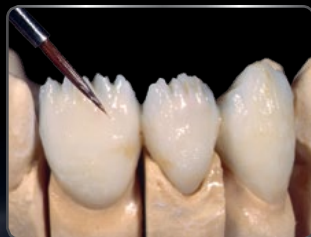
USE LUSTRE PASTES