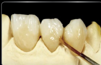
APPLICATION OF BODY SHADES