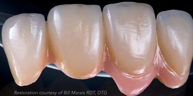
Restoration courtesy of Bill Marais RDT, DTG