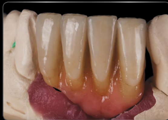
Restoration courtesy of Al Hodges CDT, DTG

Do you need to change the color, the brightness, the value, or the surface gloss of your crowns and bridges? You can use the GC Initial IQ Lustre Pastes NF on all ceramics in the GC Initial range, and virtually any ceramic..