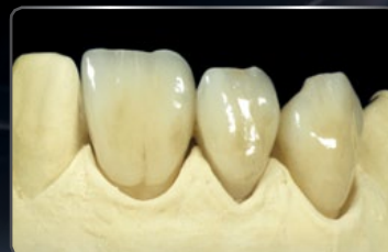
FINAL RESTORATION OFFERING COLOR AND GLOSS