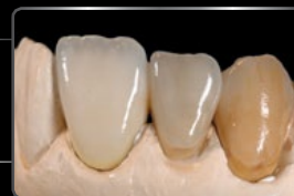
LP VALUE, L3, LA